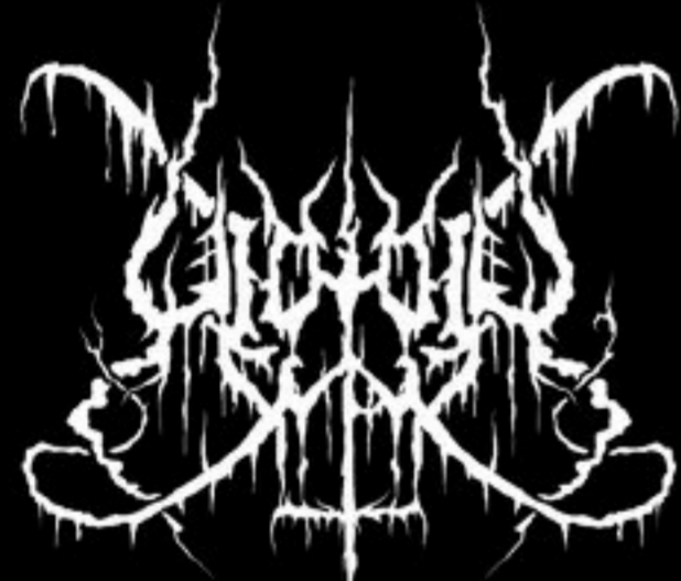
Unholy War (DE)