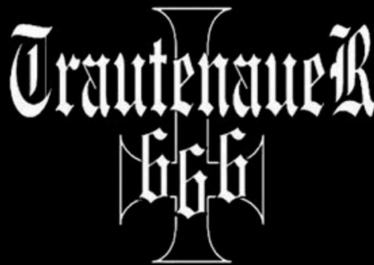
Trautenaue 666 (CZ)