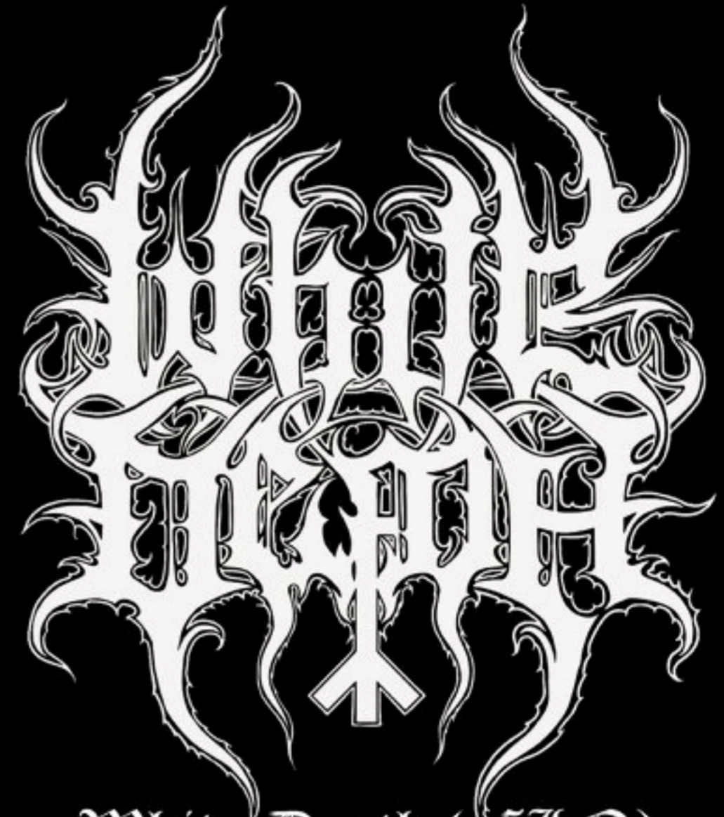
White Death (FIN)